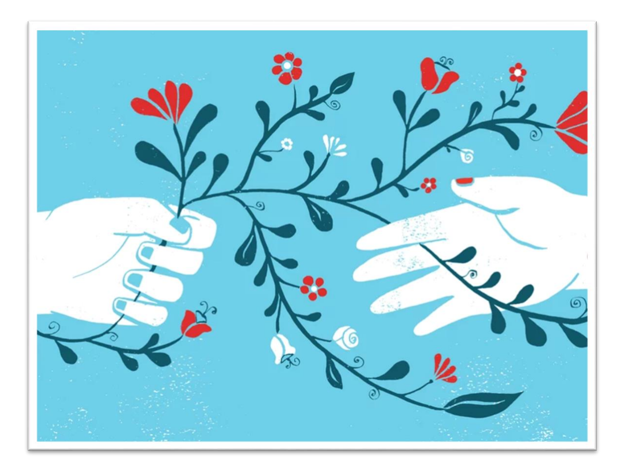
Nineteenth Sunday After Pentecost September 29, 2024 – 11:00am Worship

I am the vine; you are the branches. John 15:5