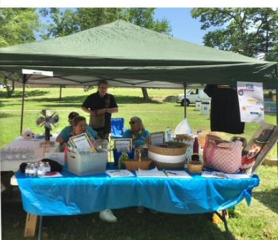
Hagerstown Pride 2024