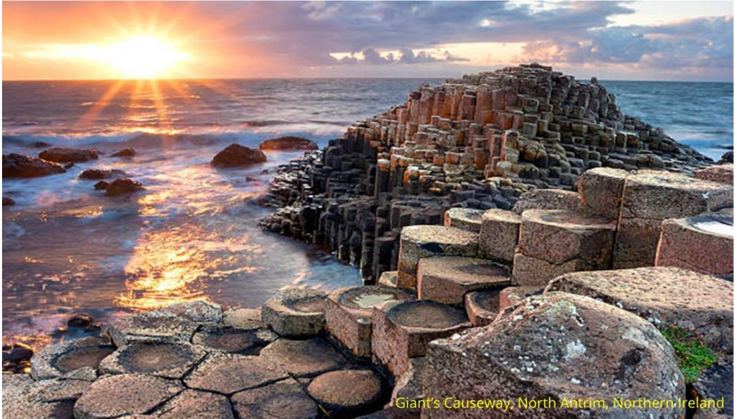
Giant's Causeway, North Antrim, Northern Ireland

March 17, 2024 - Fifth Sunday of Lent -11:00 A.M.