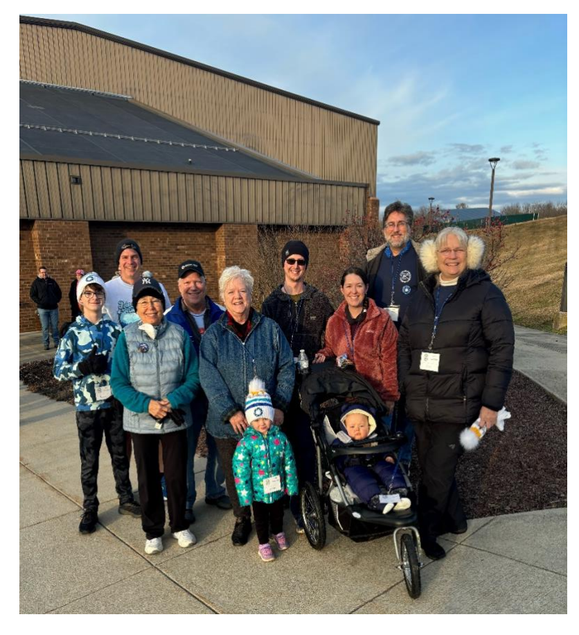
Coldest Night of the Year Zíon's Walking Team