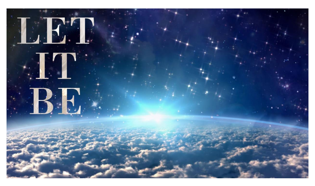
"This is how God showed his love among us: He sent his one and only Son into the world that we might live through him." 1 John 4:9